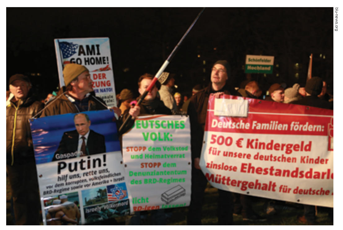
January 2015 PEGIDA demonstration in Dresden, Germany. One protester (left) holds sign appealing to Russian President Vladimir Putin: "Putin! Help us, save us from the corrupt, enemy-of-the-people BRD [Federal Republic of Germany] regime and from America and Israel!"

political violence usually associated with terrorism, this right-wing collective violence displays other essential characteristics that place it into that very category. One of the first goals of right-wing collective violence is to directly challenge the government's monopoly of force. Second, these collective attacks create terror and fear in a wide target group beyond the victims of the attack itself. Third, these acts of violence, especially arson, are carried out with a strong motivation to send a signal or create a public symbol of resistance for a wide audience. Fourth, this type of tactic allows the perpetrator to strategically attack and hide immediately afterward in the large crowd of bystanders or to escape from the location altogether. In this way, collective right-wing violence is akin to core terrorist tactics, although less coordinated and strategic. Right-wing