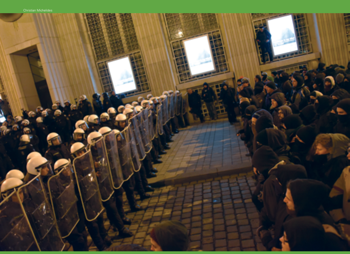
Police in Vienna separate "Fight Against the Right" and PEGIDA ("Patriotic Europeans Against the Islamisation of the Occident") activists during a February 2015 demonstration.